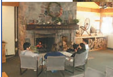
Salvation Army's Conference Centre at Jackson's Point

This weekend conference is held in the relaxed atmosphere of the Salvation Army's Conference Centre at Jackson's Point on the south shore of lake Simcoe. You'll come away from this 3-day event, refreshed in your faith and with a wealth of great memories and new friends.