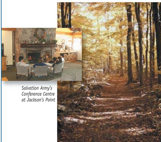
Salvation Army's Conference Centre at Jackson's Point